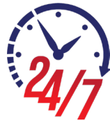
Continuous AntiMicrobial Protection 24/7