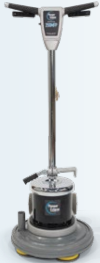
17" planetary grinder/polisher with gear driven driver and skirt