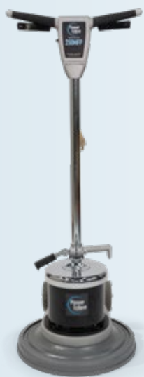
17" floor polisher with pad driver