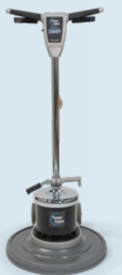
20" floor polisher with pad driver