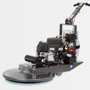
400BU Propane Burnisher A basic workhorse with the performance and safety features of higher priced machines.

Performance: up to 35,000 ft²/hr (3200 m²/hr) • TPPL battery pack • Quiet: 68 db (A) Auto adjusting pad pressure for consistent burnishing