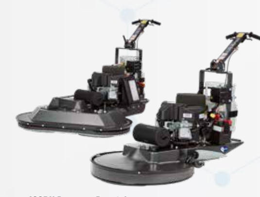
420BU Propane Burnisher Upgraded burnisher with features designed to meet the needs of demanding professionals.