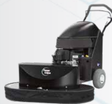
440ST Propane Stripper This highly productive stripping machine removes finishes faster than any other machine on the market.

· Dual counter-rotating drivers Quick-change pads and brushes · Simple and easy operation